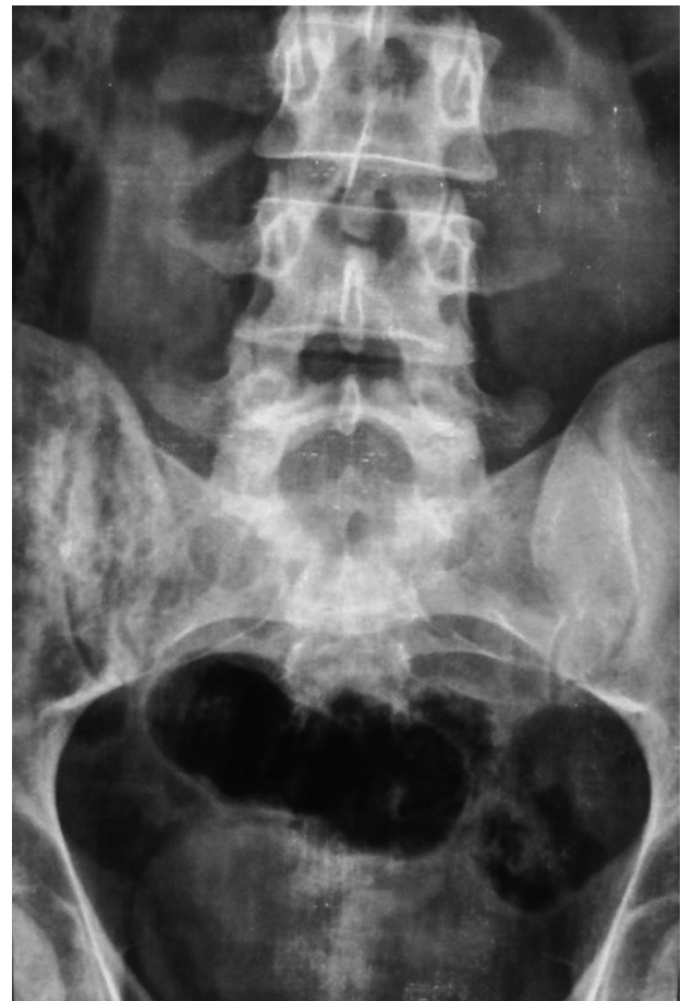
Fig. 1. Anteroposterior radiograph of the pelvis showing right sacroiliitis. The left sacroiliac joint is normal.

Despite such infections, particularly tuberculosis, being