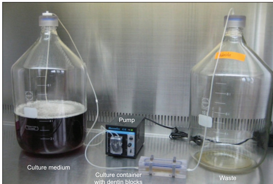
Figure 1 Luppens apparatus. The apparatus consisted of a vessel containing media, a pump, a culture container and a vessel with waste, all connected by silicone tubing.

The numbers of bacteria counted in three different groups are summarized in Table 1. In the groups soaked with 2% CHX or 1% ALX for 5 min, significantly fewer bacterial cells were observed than in the saline (control) group ( P=0.002 ), but there was no significant difference in the number of bacteria adhering to the dentinal surface between the two experimental groups ( P=0.869 ). In the groups soaked with 2% CHX or 1% ALX for 10 min, the number of bacteria