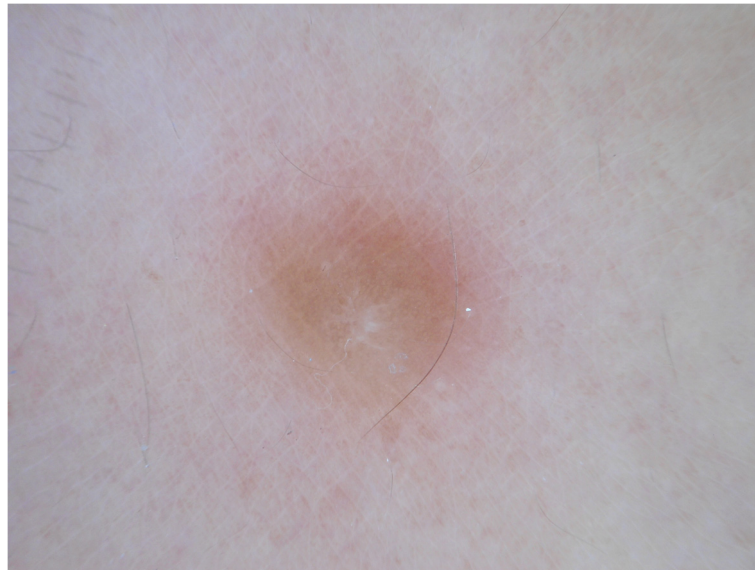
Figure 2 Dermoscopic feature of dermatofibroma of the patient. Central white scar like patch with delicate pigment network in dermatofibroma of the leg.

testing and urinalysis did not show anomalies. Abdominal computerized-tomography (CT) scan displayed uterine fibroids and normal appearing kidneys. Brain magnetic resonance imaging (MRI) showed one asymptomatic cerebral cavernoma (data not shown).