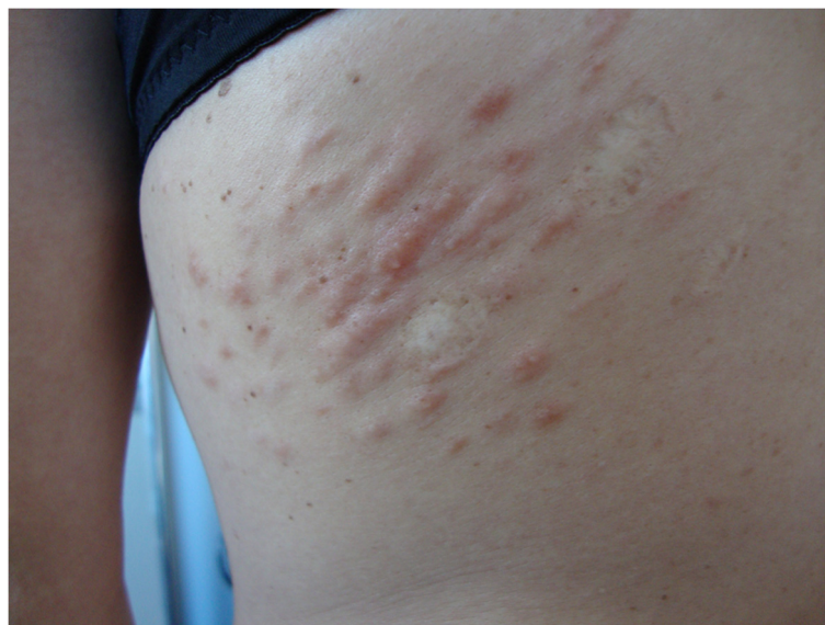
Figure 1 Clinical picture of the patient. Pink-to-brown papules and nodules on her left sub scapular region and both forearms.

Genetic analysis was performed using RNA extracted from a leiomyoma biopsy. Complete coding region sequencing of all 10 exons of Fumarate Hydratase gene (Gb #NM_000143) was evaluated using direct sequencing of RT-PCR amplified FH transcript. The sequence did not reveal nucleotide changes in coding region, due to the presence of amino acid substitutions. This does not exclude the possible presence of complex genomic mutations located inside introns, which could lead to abnormal transcripts. The level of enzymatic FH analysis should be investigated to further characterise the patients for FH activity depletion. Complete routine blood