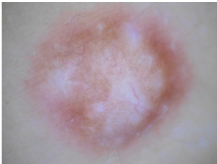
Figure 5 Different dermoscopic feature of leiomyoma. White cloud-like area without scar features.

The pigmented network pattern seems reasonably related to a reactive epidermal basal hyperpigmentation, as observed in the histologically confirmed lesions, due to