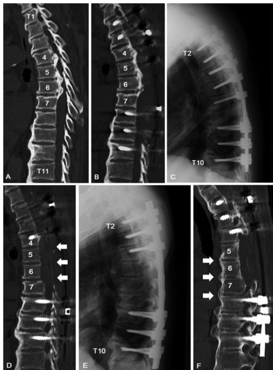
Fig. 3 Case 2, a 61-year-old man. (A) Preoperative computed tomography (CT) sagittal image. (B, C) Lateral plain radiograph and CT sagittal image after posterior decompression and instrumented fusion (first surgery). (D, E) Postoperative lateral plain radiograph and CT sagittal image after resection at an anterior site of the spinal cord from a posterior approach (RASPA; second surgery, arrow). More thoracic dekyphosis was achieved after the second surgery than after the first surgery. (F) At final follow-up, the ossification of the anterior longitudinal ligament was also extended and fused, with stabilization of the thoracic spine (arrow).

about 3 weeks after the first surgery or if symptoms worsen. The two-stage posterior decompression with dekyphosis and anterior decompression surgery proposed by Kawahara et al involve decompression along the circumferential spinal cord with spinal fusion (the ideal decompression). 3 Kawahara et al also suggested a need for additional anterior decompression from an anterior approach at 3 weeks after the posterior surgery. We also believe that a second surgery of anterior decompression of the spinal cord with OPLL resection is required if there is no improvement or if symptoms are aggravated at 3 weeks after surgery. However, because improvement is gradual, the second surgery may not be necessary if there is even a slight improvement in symptoms after the first surgery.