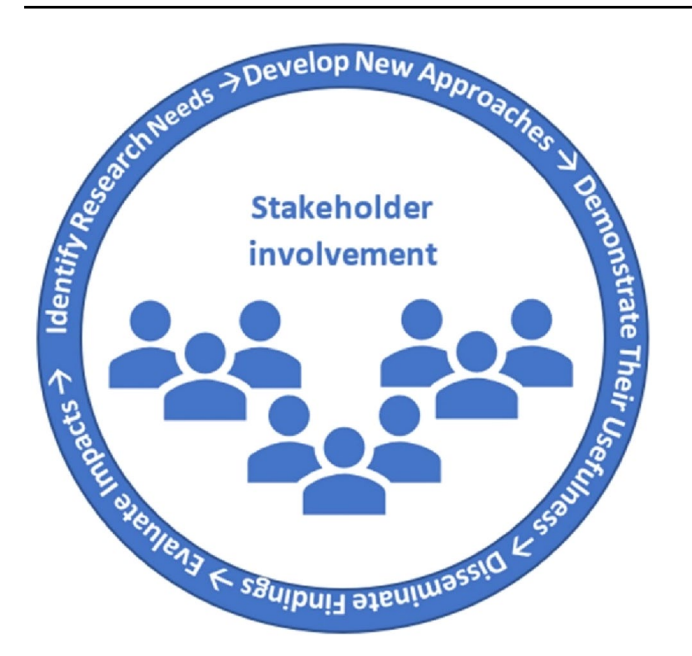
Fig. 2 Diagram of the centrality of stakeholder engagement to the solutions-driven research process. This figure is modified from the National Institutes of Health's National Center for Advancing Translation Research to be relevant for an applied environmental science effort (U.S. Environmental Protection Agency's nutrients solutions-driven research pilot) (National Institutes of Health, 2020)

we used semi-structured interviews and a qualitative analytic approach. We conducted semi-structured interviews with EPA ORD researchers and external stakeholders that are involved in one or more aspect of the nutrients solutionsdriven research pilot. For this project, we divided our participants into those on the internal research team, referred to as "researchers," and those participating in the project from outside of EPA ORD, the "stakeholders." A total of 10 researchers internal to the ORD research team volunteered and participated in interviews, and 10 external key stakeholders, one of which was a federal employee, also participated (Table 1). All internal researchers involved with the pilot were asked in-person whether they would like to participate in a confidential interview, and those who expressed initial interest were sent a follow-up recruitment email with further project and scheduling details. Invitation