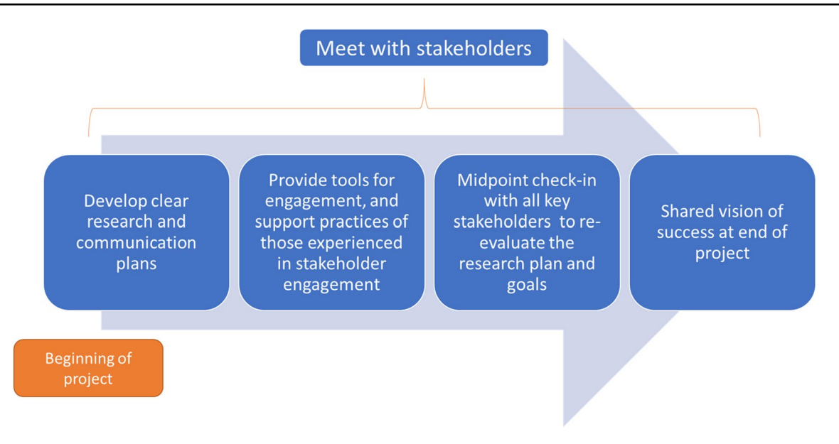
Fig. 4 Visualization of project guidance recommendations throughout a solutions-driven project

SDR. These guidance recommendations are in line with stakeholders' comments as well, as they sought increased frequency of whole team communication, and greater clarity on project goals and participants' roles.