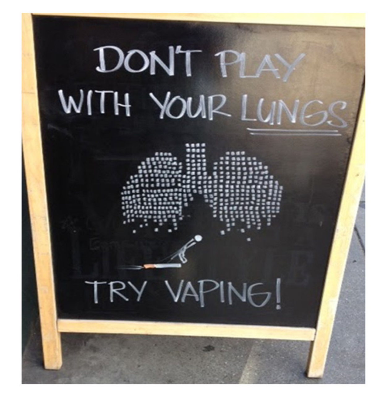
Figure 2. Example of exterior sign indicating vaping is healthier than smoking.