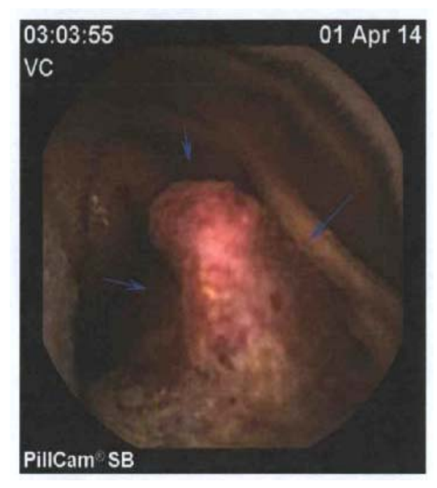
Figure 1. Video capsule endoscopic imaging of small bowel mass

After entering abdomen, the small bowel was run from the ligament of Treitz until the lesion was identified. The mass was found in mid-jejunum, protruding from small bowel lumen and adherent to the small bowel mesentery (Figure 2).