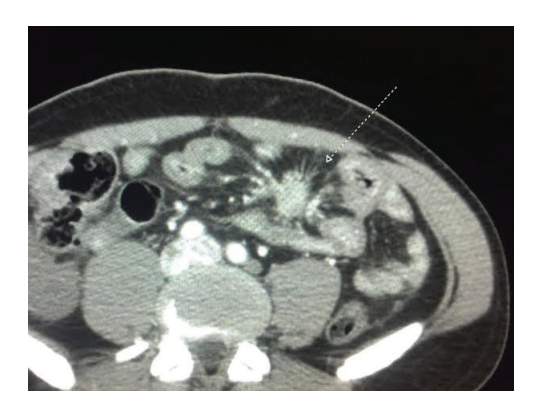
Figure 1. Fibrosis with mesenteric retraction in a patient with CS.

The association between CS and skin fibrosis was first described in 1958 [88]. Cutaneous scleroderma is a rare and usually late feature of CS characterised by skin thickening and loss of elasticity because of dermal fibrosis [89]. Bell and colleagues reported a series of 25 patients with carcinoid tumours, two of them with scleroderma [90]. Serotonin and other vasoactive substances are believed to be the causative agents of scleroderma as a result of inflammatory response because of recurrent vasospasm and flushing attacks [80–91]. Data is very limited regarding treatment. Previous isolated reports described significant improvement of cutaneous signs after treatment with octreotide [92], cyproheptadine, or prednisolone [89]. A small series of six male patients with CS described that two of them developed plastic induration of the penis (Peyronie's disease) [93]. Moss and colleagues analysed CT scans of 50 patients with midgut NET and detected pleural thickening in 14 of them. Nine cases were considered idiopathic and could be probably because of CS [94]. Cases suggesting associations between CS and diffuse interstitial pulmonary fibrosis [95] and obliterative bronchiolitis with airflow obstruction in pulmonary tests have been reported [96].