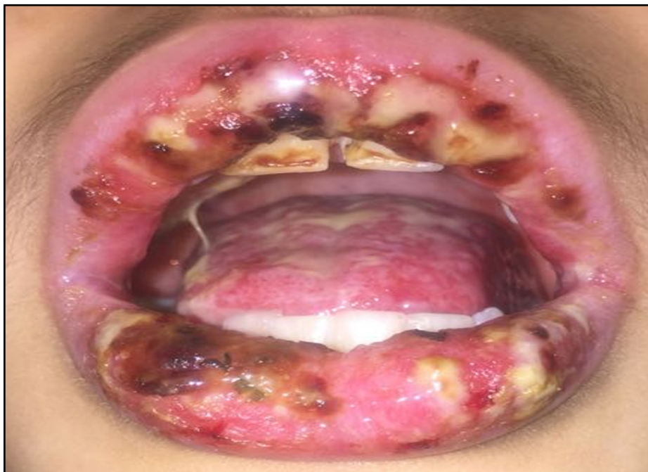
FIGURE 1: Multiple crusted hemorrhagic ulcers covering the buccal mucosa, palate, and gingiva with blackish lip crusts

During the hospital course, the patient developed severe abdominal pain associated with nausea and vomiting. Abdominal ultrasonography revealed a large lobulated hyperechoic mass lesion compressing the gallbladder. An abdominal CT scan was performed for further evaluation of this mass. It demonstrated a mass lesion located superior to the kidney but was not crossing the midline. There was no evidence of thrombosis or lymphadenopathy (Figure 2).