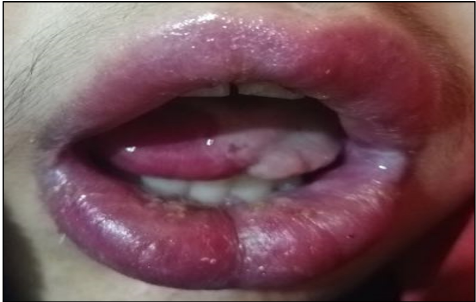
FIGURE 3: Remarkable improvement in the patient's condition after the systemic immunomodulatory therapy

The medications were tapered gradually over a period of two weeks. The patient was discharged in a good condition on low-dose prednisolone and cyclosporine. He sustained remission for 18 months without any disease flare.