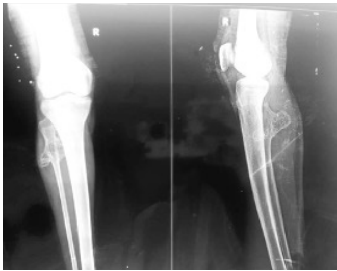
Figure 1: Plain radiograph AP and lateral view of the right leg with knee showing large cauliflower-like growth arising from proximal fibula.