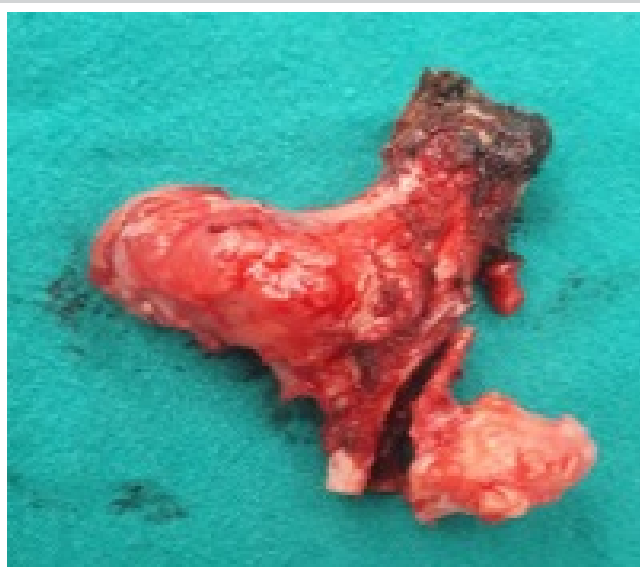
Figure 3: En bloc excised tumor.

surgery to grow through the common peroneal nerve, splitting it into two limbs [10]. Wankhade et al. in 2016 also reported a case of proximal fibular osteochondroma causing splitting of common peroneal nerve, leading to neuropathy in an adult [2].