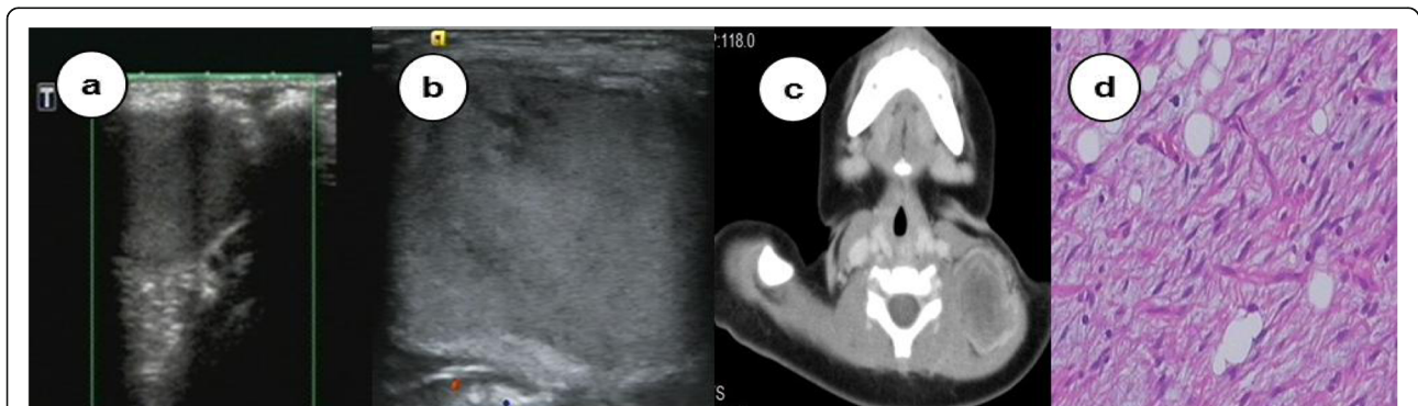
Fig. 2 A patient with a lipoblastoma misdiagnosed as a cervical lymphatic malformation complicated with haemorrhage

organs, affecting breathing, swallowing, and making sounds, and can be life-threatening. Therefore, surgery, radiotherapy, or interventional therapy must be carried out. However, surgery may damage adjacent blood vessels and nerves, cause hematoma, and affect appearance. Moreover, the incidence of complications from surgery is 19–33%, the postoperative recurrence rate is 53%, and the mortality rate is 6% [7, 27]. Therefore, interventional sclerotherapy is a better choice for recurrent and surgically unresectable lesions, reducing tumour volume before surgery, reducing injury, and improving aesthetic appearance [7, 28]. Sclerotherapy has thus become the primary treatment for cervical lymphatic malformations; however, it has side effects such as metabolic acidosis, hyperhaemoglobinaemia, and cellulitis [29]. Therefore, patients with large-volume or multilocular cysts should undergo sclerotherapy in stages or for residual lesions after surgical resection to avoid toxic side effects. In this study, patients received treatment according to their condition; most patients underwent sclerotherapy once, and few patients underwent sclerotherapy two or more times. Several patients underwent surgical resection or concurrent surgical resection and sclerotherapy. Expectant management was provided for patients with