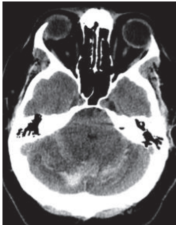
FIGURE 2: Nonenhanced CT head image at the level of the cerebellum demonstrates acute haemorrhages in both cerebellar hemispheres (arrow) with edema, causing mass effect on the fourth ventricle.

site of surgery. It may result as a consequence of cranial or spinal surgery, due to the opening of CSF cisterns, drainage of the ventricular system, or inadvertent tearing of the dura (dural tears having been reported in up-to 0.3% to 5.9% patients undergoing spinal surgery) [1]. Of note, while RCH is more commonly seen after supratentorial procedures, it may also occur following infratentorial or spinal surgeries.