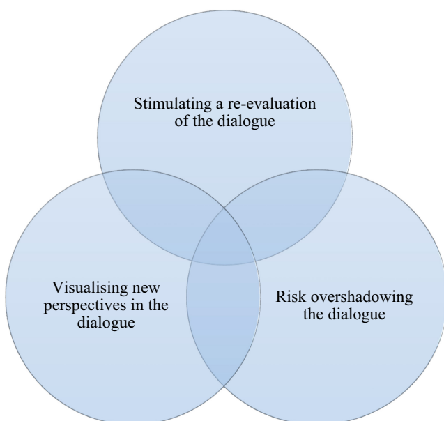
FIGURE 1 Themes of how ExBreastS influences the caring dialogue

An awareness of the existential aspects of breastfeeding supports a new openness and responsiveness toward breastfeeding mothers. Working with ExBreastS not only changes the dialogue at hand but also causes nurses to re-evaluate their entire way of thinking about the caring dialogue about breastfeeding. One nurse notes the following: 'You have it with you in some way, even in other dialogues [in child healthcare]'. ExBreastS also makes nurses re-evaluate the importance of continuous dialogue throughout the entire breastfeeding period. ExBreastS works like an icebreaker during the initial meeting, making the atmosphere of the dialogue more relaxed, which makes it easier to get the dialogue to flow. This facilitates future follow-up dialogue, as one nurse says, 'It can be easier for us