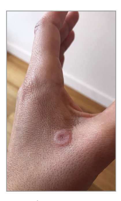
Figure 3 Erythema multiforme-like lesion on the hands.