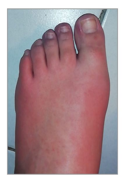
Figure 5 Diffuse vascular erythema and oedema of dorsum of feet.

Skin biopsies were obtained for 29 patients (17 patients typical chilblains, two with EM-like lesions, one with punctiform purpuric lesions, nine without photographs). All but three cases (superficial biopsy or unspecific findings) exhibited vacuolization or apoptosis of keratinocytes, superficial and deep infiltrates, mainly of lymphocytes with a perieccrine and