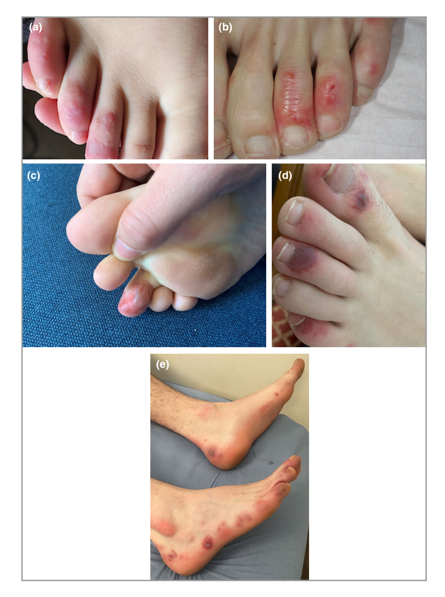
Figure 2 Typical chilblains. (a, b) Typical lesions observed in a majority of patients. (c) Typical chilblains with bullae. (d) More severe lesions with purpuric aspect. (e) Chilblains on the toes and lateral side of feet.

serology only). Six (2%) patients had a history of autoimmune disease, 32 (10%) patients had a history of chilblains and 31 (10%) patients had a history of Raynaud syndrome; six of these patients had both Raynaud syndrome and chilblains.