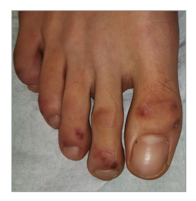
Figure 4 Punctiform purpuric lesions on the toes and feet.

(12%) cases. The median time between infectious symptoms and the appearance of acral lesions was 10.5 days (IQR 1–16) (data available for 148 patients with infectious symptoms) and acral lesions preceded infectious symptoms in 23 cases.