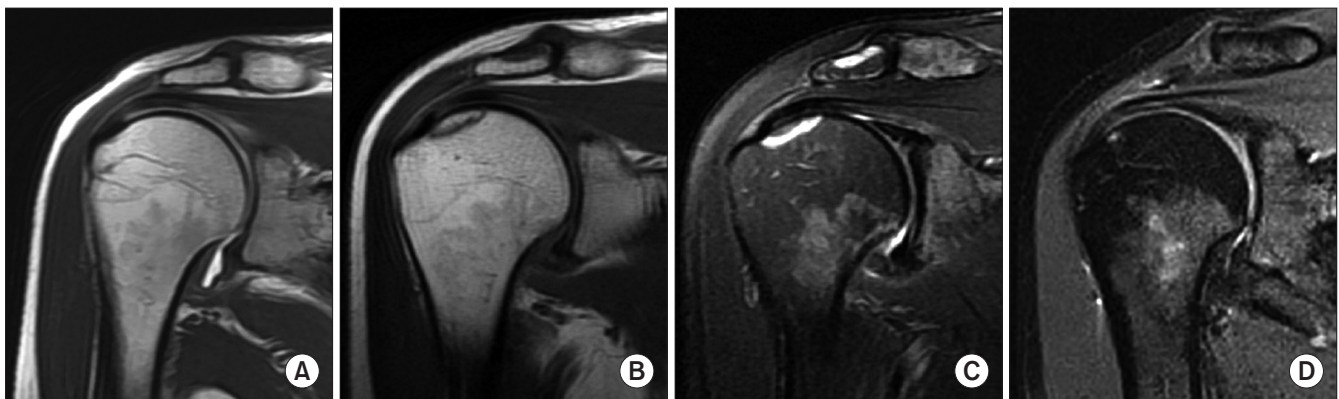
Fig. 2. Serial magnetic resonance (MR) examinations of patient 1 show development and near-complete resolution of focal bone marrow abnormalities after ultrasound diathermy. (A) Pre-physiotherapy MR arthrogram T1-weighted image shows no definite abnormality in the humeral head. Post-physiotherapy MR imaging (MRI) T1-weighted image shows hypointense band-like lesion (B), and T2-weighted fat-suppressed image shows hyperintense band-like lesion at right superolateral humeral head (C). Similar bone lesions are seen at superior surface of the acromion. Notably, all lesions are superficially located. (D) Follow-up proton density fat-suppressed MRI performed 13 months later shows near complete resolution of the lesions.