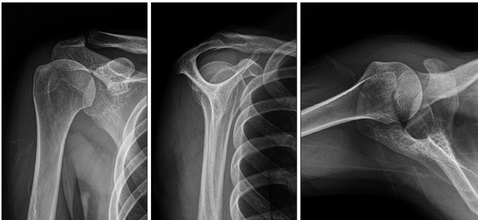
Fig. 1. Simple radiographs of patient 1 reveal minor sclerotic changes of shoulder joint.

Nonsteroidal anti-inflammatory drugs (NSAIDs, zaltoprofen) were prescribed, and a stretching program was implemented to address frozen shoulder. She was followed-up regularly, and there was no evidence of progression of osteonecrosis. In fact, she showed marked improvements in ROM and pain. By 14 months after the initial visit, she had progressed to near full ROM of FF, ER at side, and IR at back of 165°, 80°, and the level of the seventh thoracic vertebrae, respectively, and pain VAS of 0. Follow-up MRI examination, performed at 13 months after ini-