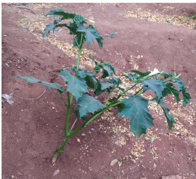
Figure 1 Picture of Datura stramonium .

Various studies showed that Datura stramonium endowed antiepileptic, anti-obesity, anti-microbial, anti-