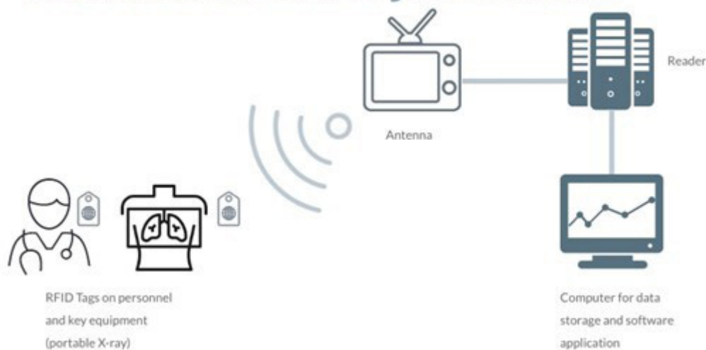
Figure 1 RFID system infrastructure. RFID, radiofrequency identification.

account of the virus's high infectivity and potential for asymptomatic transmission, as well as testing turnaround times creating a delay between patient encounter and lab confirmation, there is a critical need for robust contact tracing. Incumbent analogue measures are imprecise and arduous; thus, there is a role for RFID to provide a real-time system that can track all points of contact and can also be subsequently analysed to inform those who came into close contact with a known positive case (figure 2). 5