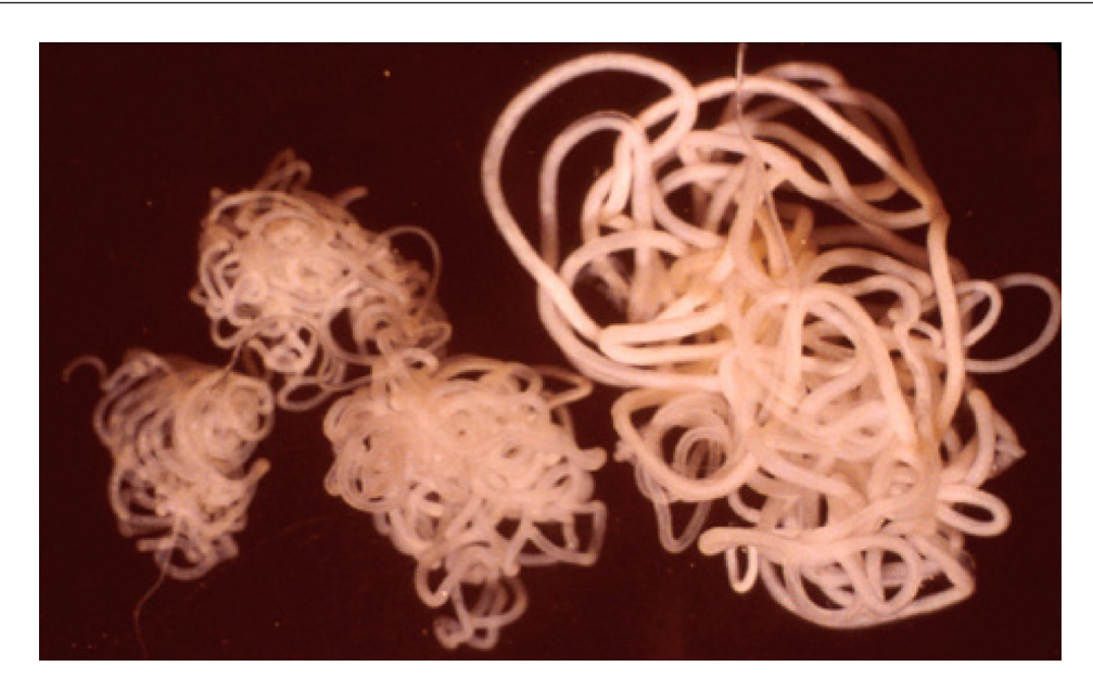
Figure I Onchocerca volvulus filarial parasites (three adult males and one adult female).

of overt disease, brought infection to the point of elimination of its transmission, and begun to break the infection cycle permanently in many areas. The use of the MDA approach with ivermectin, for the first time with onchocerciasis, has changed the face of tropical medicine and the provision of health care services to populations that have been the most under-served in the world. A concerted global effort is now underway to finally eliminate onchocerciasis, along with other parasitic diseases such as lymphatic filariasis, from their respective endemic areas. Elimination, ie, breaking of transmission for 3 years at unsustainably low levels,<sup>1</sup> has now occurred in Colombia<sup>2</sup> and Ecuador<sup>3</sup> as well as in specific endemic foci in Africa.<sup>4</sup> Other countries are likely to reach the state of complete breaking of transmission, especially in Latin America where, for example, Mexico is poised to join the successes of Colombia and Ecuador.<sup>5,6</sup> Indeed, this is a most exciting time in tropical medicine, when such possibilities as elimination are even considered as achievable goals. This review summarizes the path taken to this point with regard to the chemotherapeutic treatment of river blindness, and suggests some ways that it may change as we approach the goal of elimination of onchocerciasis as a public health concern by 2025.7