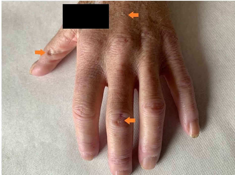
FIGURE 1: Clinical presentation of sclerodactyly and calcinosis cutis lesions on the left hand of a 66-year-old Caucasian female

(BMI = 12.1 at a bodyweight of 30 kg) with a flat, rigid abdomen, and diffuse abdominal tenderness to palpation throughout all four quadrants. The patient also had very dry oral mucosal membranes without visible oropharyngeal lesions, erythema, or thrush. Cutaneous examination of her hands revealed inward curling of the fingers with hard, white-yellow lesions on multiple digits of both hands ranging in size from 0.5 x 0.5 cm to 1.5 x 1.0 cm (Figure 1). The remainder of the patient's physical examination was unremarkable.