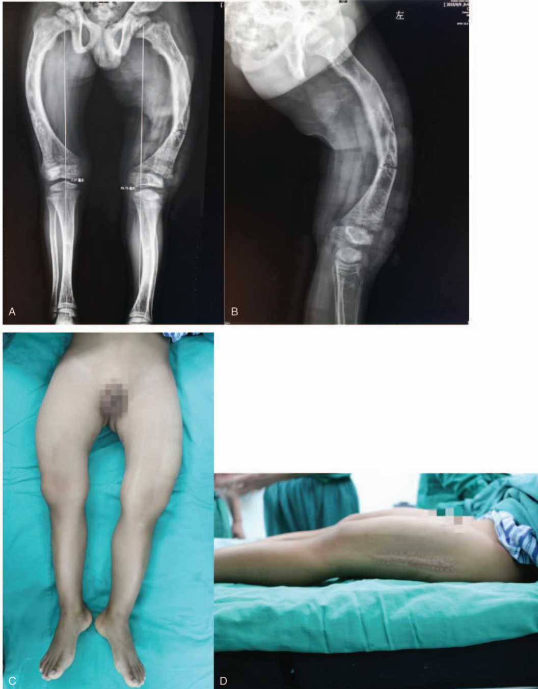
Figure 1. (A) Full-length lower extremity radiograph of 11-year-old boy of left distal femoral fracture; (B) lateral view of femur; (C) appearance of lower extremities on supine position; and (d) lateral view of thigh.

Physical examinations revealed tenderness at the distal left thigh, and old incision scars about 14cm on the lateral skin of diaphyseal femur. The genu varum was prominent when the