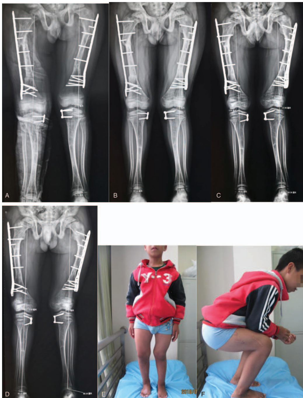
Figure 5. (A) Two months after second operation; (B) 5 months after second operation; (C) 12 months after second operation; (D) 28 months after second operation; (E) appearance of patient on standing position; and (F) flexion of hip and knee joint.

Reported recurrence after corrective surgery is about 0% to 90%, [14,15] and it appears to be related to the timing and fixation method. Patients who received surgery before skeletal maturity generally had a higher recurrence rate. [14,15]