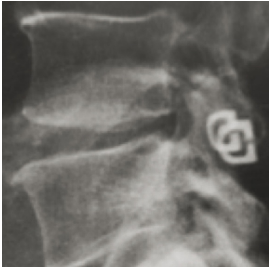
FIGURE 2: FFX devices inserted into the facet joints on the right and left sides of the spine.

For FFX procedures, open laminectomies were performed, followed by FFX fixation. The laminectomy procedure included complete ablation of the laminae facing the canal narrowness followed by an internal facetectomy with radicular recalibration. Tracking of the facet joints line spacing was performed with a facet chisel followed by a reviving of the facet joints with a rasp to promote fusion. Two implants were used per level. After connecting the FFX implant onto the facet holder, bone graft material was inserted into the empty space of the device. While attached to the facet-holders and at the entry of the facet joint lines, the devices were inserted into the facet joint simultaneously on the right and left sides, under direct visualization (Figure 2). The devices were then pushed into place using a supplied impactor and positioned appropriately. The above was followed by a laminectomy and bone graft material added posterior to the inserted implants. For PS procedures, open laminectomies were performed in a similar manner as was done FFX fixation with the exception of preserving the facets. PSs placement was performed using fluoroscopic guidance. Surgical wounds were closed and sutured per standard routine following completion of the procedures.