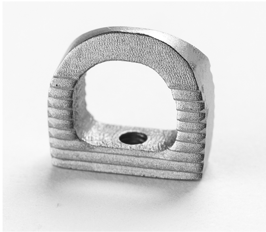
FIGURE 1: Lumbar Facet FiXation (FFX) device.

The present study was a non-randomized, retrospective cohort analysis of patients with LSS undergoing spinal fusion surgery via PS fixation or the FFX device during two separate time periods. The study was approved by the Institutional Review Board at Hôpitaux Civils de Colmar (approval number 17/002). The PS group consisted of all the patients with LSS operated on in 2016 who underwent an open technique for decompression, specifically laminectomies, concomitant to PS fixation. The FFX group included all the patients with LSS operated on in 2018 who underwent open laminectomies concomitant with FFX fixation. These two time periods were selected as a result of PS being used as the primary implant for LSS-associated surgeries during 2016 and the transition to only using the recently introduced FFX device was completed prior to 2018. In order to avoid the potential for operator and institutional bias, the study only included procedures performed by a single surgeon at the same institution (Figure 1).