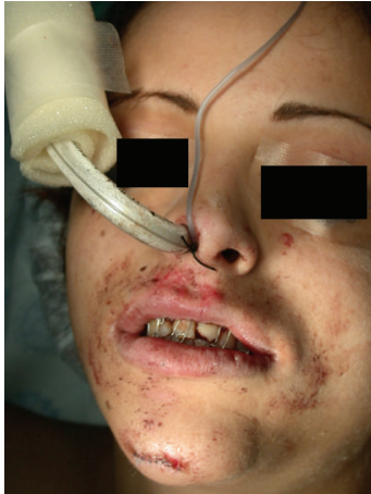
FIGURE 2: A patient with maxillofacial trauma ventilated through a nasal endotracheal tube.

At this point, a decision needs to be made on the type of airway control which is suitable for the intended surgery. Some patients arrive to the operating room conscious and spontaneously breathing and their maxillofacial trauma is not extensive. In selected patients, nasoendotracheal intubation can be used for airway control during surgery [58] (Figure 2). However, nasoendotracheal intubation is relatively contraindicated in patients with midface fractures or fractures at the base of the skull [59].