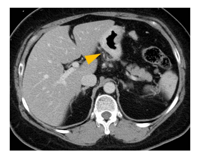
Figure 1. CT image showing thickening of the gastric body wall with contrast enhancement (arrow). CT, computed tomography.