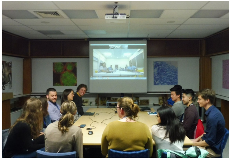
Fig. 1 GHCR session underway showing New Zealand students with Samoan students on the screen