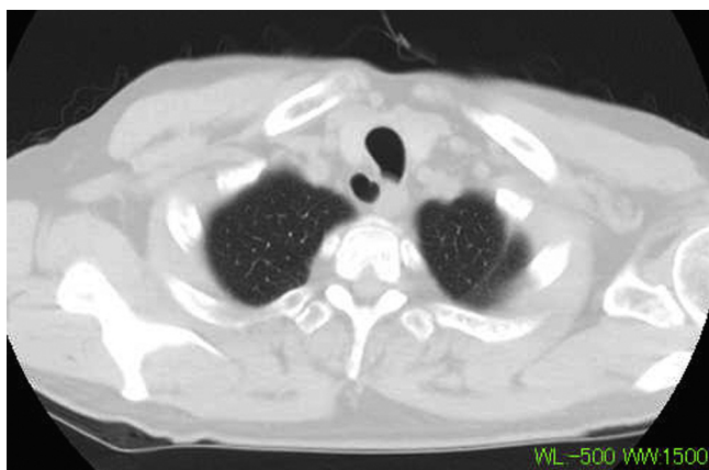
Fig. 2. A CT scan performed 4 years previously showing a tracheal diverticulum in the same position as the mass.