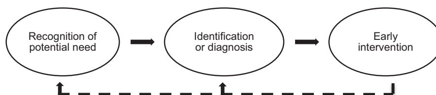
FIGURE 1 Pathway of access to early intervention

Various factors might influence the process of access to EI, and the way these factors operate may vary for the three different phases. Using our framework depicting the pathway of access to EI might be a useful starting point to identify factors that influence access to EI for families of children with developmental disabilities, to develop understanding of why some families are not accessing support.