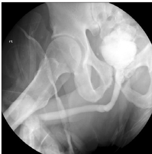
Fig. 3. Postoperative voiding cystourethrogram demonstrating excellent patency of the entire urethra.

Through the dorsal urethrotomy, the ventral urethral plate was sharply incised in the midline without significant violation of the spongiosum. The wings of the opened plate were mobilized with sharp dissection to allow for an elliptical defect. The graft was sewn into place by using two separate 5-0 PDS sutures in running fashion (Fig. 2D). A lubricated 16-Fr silicone Foley catheter was then placed under vision across the repaired area (Fig. 2E). The dorsal urethra was reapproximated with running 5-0 PDS sutures (Fig. 2F). The perineum was closed in three layers of absorbable sutures. Overall blood loss was minimal and the patient suffered no intraoperative complications.