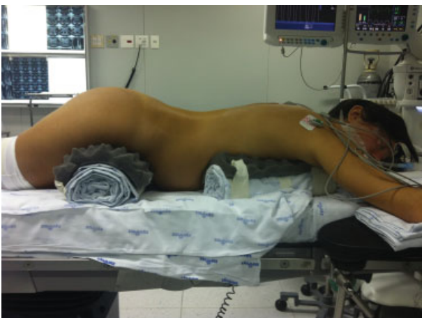
Fig. 2 Intraoperative photo demonstrating the patient positioned over cushions to prevent abdominal compression.

In the 40th week of pregnancy, the patient had a cesarean delivery due to functional dystocia and gave birth to a baby weighing 3.6 kg. Apgar scores were 10/10 at 1 and 5 minutes, respectively, and no complications were noted.