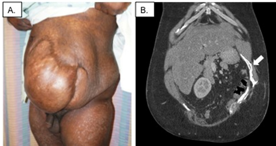
Fig. 1. Panel A: Clinical pre-operative exam demonstrating a large ventral hernia covered with skin graft. Panel B: Computed tomography image of purported retained mesh (arrow) lateral to the patient's large non-incarcerated ventral hernia, despite no history of attempted prior hernia repairs.