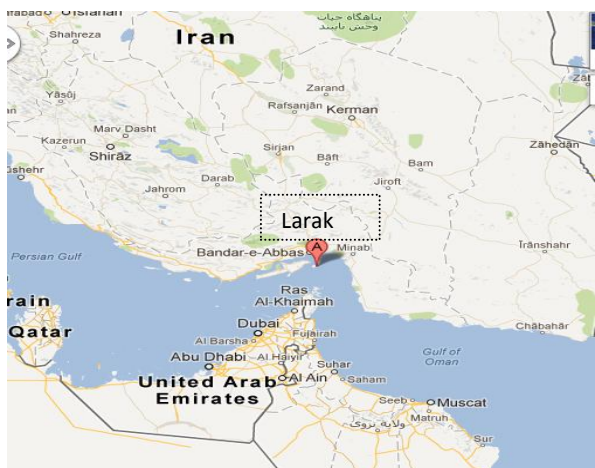
Figure 1. Study area in Larak island, south of Iran (26° 51'23"N, 56° 21' 3"E)

Swiss albino mice weighing 20 to 25 g were chosen after an acclimatization period of at least 7 days in the laboratory environment and standard food pellets and water was provided. Morphine purchased from DaruPakhsh Pharma Chem. Co., Iran. Formalin was obtained from Merck Chemical Company.