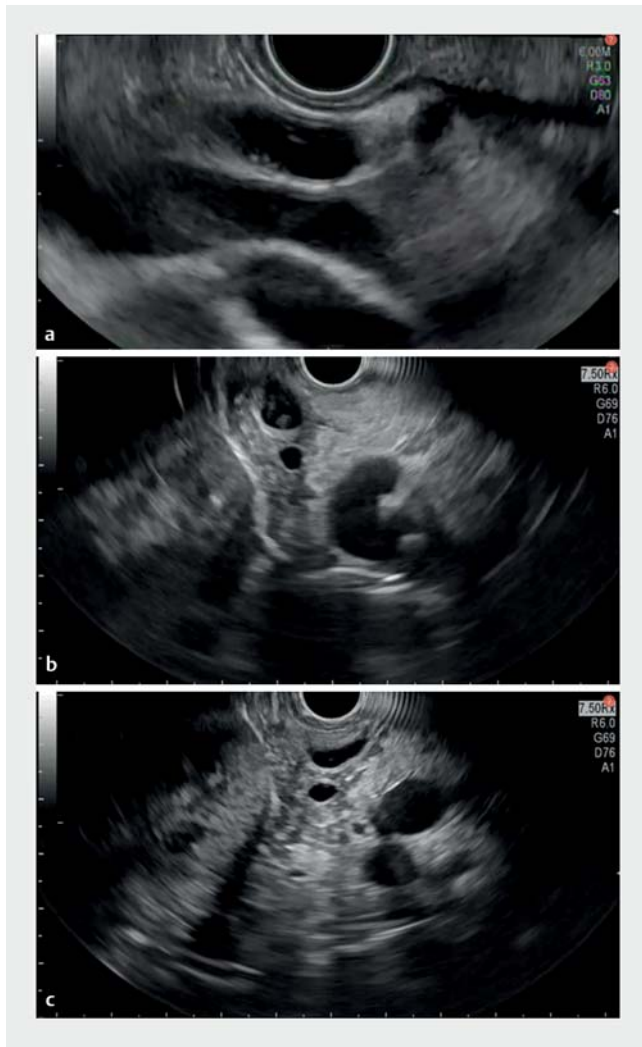
► Fig. 1 Images of evaluated EUS videos. Microlithiasis, sludge or artifact?

Secondary endpoints were the interobserver agreement on the need for ERC+ES (yes/no) and differences in interobserver agreement between experts and non-experts.