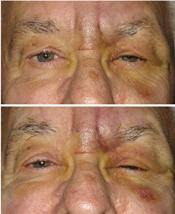
Fig. 1. Top: Mild periorbital erythema and left upper lid swelling were present on initial presentation. Bottom: One week later, periorbital erythema and left upper lid swelling have become more pronounced.