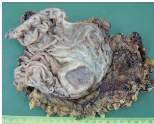
Figure 1. Gastric Burkitt lymphoma—an ulcerated tumor with elevated margins located in the antrum and posterior wall of the gastric body.

Microscopically examination revealed proliferation of medium-sized atypical cohesive-lymphocytes invading all gastric layers; pleomorphic nuclei with dispersed chromatin, and a high mitotic rate were also noticed. Several macrophages were admixed with