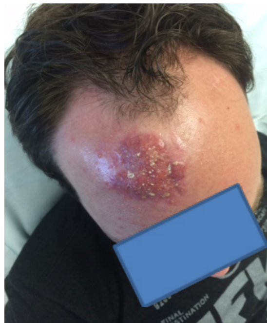
Figure 1. Cellulitis-like rash with draining and crusting.

tion, he had developed purulent discharge from the laceration site, and he was started on doxycycline. After completing antibiotic treatment, he was seen by a dermatologist due to persistent rash and a punch biopsy was taken from the area.