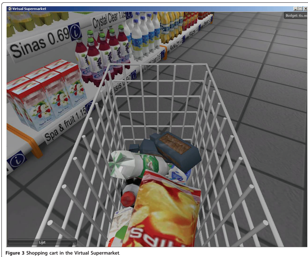
Figure 3 Shopping cart in the Virtual Supermarket.

these changes can be made using comma-separated values in Excel or using a text editor.