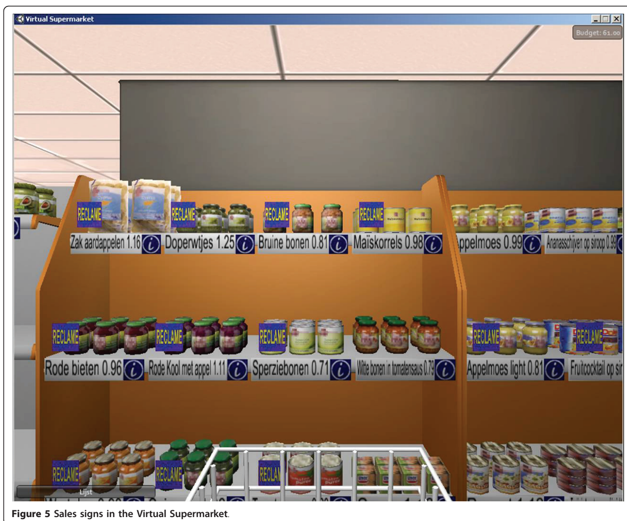
Figure 5 Sales signs in the Virtual Supermarket.

disagree) (Table 2). Around half of the respondents agreed that the Virtual Supermarket had a sufficient variety of products in stock ( n = 37 agree, n = 14 neutral, n = 15 disagree), and thought that the stock of the Virtual Supermarket resembled the stock of a real supermarket ( n = 34 agree, n = 11 neutral, n = 21 disagree). Moreover, most respondents indicated that the products they selected in the Virtual Supermarket corresponded to their normal weekly groceries ( n = 52 agree, n = 7 neutral, n = 7 disagree). Both the results on participant level and at the technical level imply that the Virtual Supermarket is a good-quality tool to measure shopping behaviour.