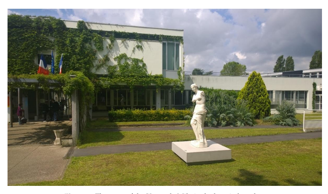
Figure 1. The copy of the Venus de Milo in the hospital garden.

This art engagement activity was established through a partnership between the Musée du Louvre , and the Assistance Publique-Hôpitaux de Paris ( APHP ). This activity was planned by the museum's and APHP's boards of directors to improve quality of stay of patients hospitalized in Paris and city's suburban areas. Pro forma reprints and copies at a 1:1 scale of artworks from the Louvre museum, Paris were offered for exhibition in selected medical departments of René Muret hospital, a hospital belonging the Hôpitaux Universitaires of Paris-Seine Saint Denis group which is located in a large suburban area Northeast of Paris. Artworks consisted of 4 large monumental statues displayed over the hospital gardens, 30 copies of large masterpieces of painting displayed over the hospital hall, dining rooms, and in the circulation areas, 200 reproductions of small size paintings displayed in the patients' rooms (Figure 1). Patients were asked for choosing paintings to be placed in their personal room on the basis of their own preference using a catalogue with selected reprints from the Louvre's collections.