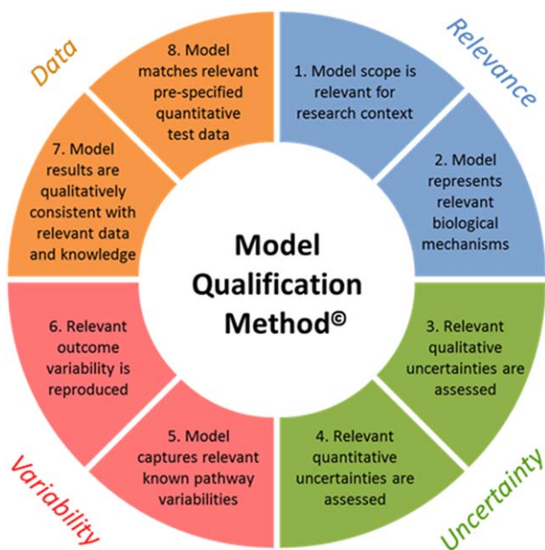
Figure 2 Graphical illustration of the eight criteria of the model qualification method.

All criteria of the MQM must be considered in every modeling project, to the extent appropriate to the research context (defined in the section below).