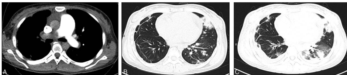
Figure 1. Chest CT images of a patient with choriocarcinoma accompanied with pulmonary embolism. (A) CTPA revealed complete occlusion of right pulmonary artery on admission (August 10, 2016). (B) Chest CT on August 10, 2016, showed pulmonary nodules in the lower lobe of the left lung. (C) CT scan on August 15, 2016, showed deterioration of pulmonary lesions in lower left lobe, including an increase in the number and size of pulmonary lesions. CT = computed tomography, CTPA = computed tomography pulmonary angiography.

On the basis of a multidisciplinary consultation meeting, gestational trophoblastic neoplasm was highly suspected as the cause of PE in this patient. We further excluded the possibility of mole abortion and invasive hydatid disease by reviewing her medical history and performing abdominal and pelvic-enhanced CT examinations. A diagnosis of choriocarcinoma accompanied with PE was established based on a combination of clinical and laboratory findings following the criteria formulated by the International Federation of Gynecology and Obstetrics (FIGO), [6] and the guideline of European Society for Medical Oncology. [7,8] Subsequently, the patient was given the high-risk EMA-CO (etoposide-methotrexate-actinomycin D-cyclophosphamide-vincristine) chemotherapy regimen. On the second day of chemotherapy, her dyspnea aggravated and required noninvasive ventilation. Two days after the end of chemotherapy, her dyspnea improved and the ventilation was discontinued. Serum \beta\text{-HCG} decreased to 10,946.67 IU/L (Fig. 2) and pulmonary artery systolic blood pressure decreased to 64.7 mm Hg with echocardiography (from 81.6 mm Hg on admission). Unfortunately, bone marrow inhibition (degree II) was noted and her Karnofsky Performance Status (KPS) score