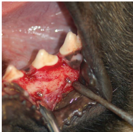
FIGURE 2: Inserted microimplants.