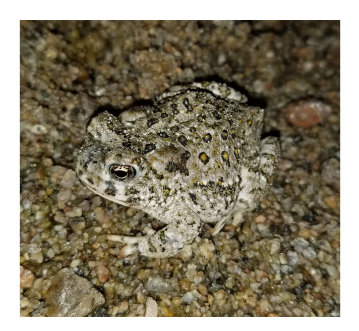
FIGURE 1 Arroyo toad (Anaxyrus californicus)

The arroyo toad is a habitat specialist, requiring low-gradient intermittent streams and rivers with sandy terraces and banks, as well as gravel and sand bars (Cunningham, 1962; Sweet, 1992; Sweet & Sullivan, 2005). Reproduction is dependent upon the availability of shallow and slow-moving streams typical of a natural flood-disturbed environment in which breeding, egg laying, and larval development occur (Sweet, 1992; Sweet & Sullivan, 2005; Thomson et al., 2016; USFWS, 1999). These habitat features are largely dependent on natural hydrological cycles and scouring events (Jennings & Hayes, 1994). A recent study on longevity estimates that this species lives approximately 7–8 years on average (Fisher et al., 2018). The drought in southern California peaked in 2012–2016 (Diffenbaugh