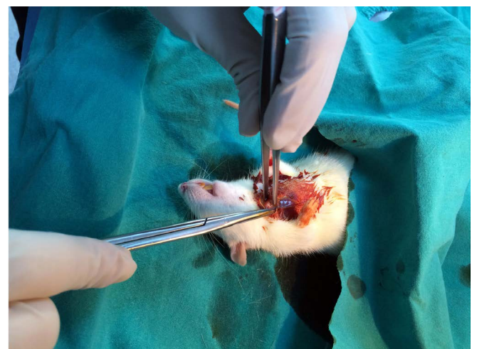
Fig. 2 - Removing of the upper sternum.