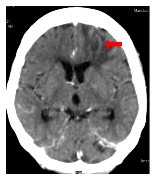
FIGURE 3: Computed tomographic scan of the brain showing abscess in the left frontal lobe (arrow).