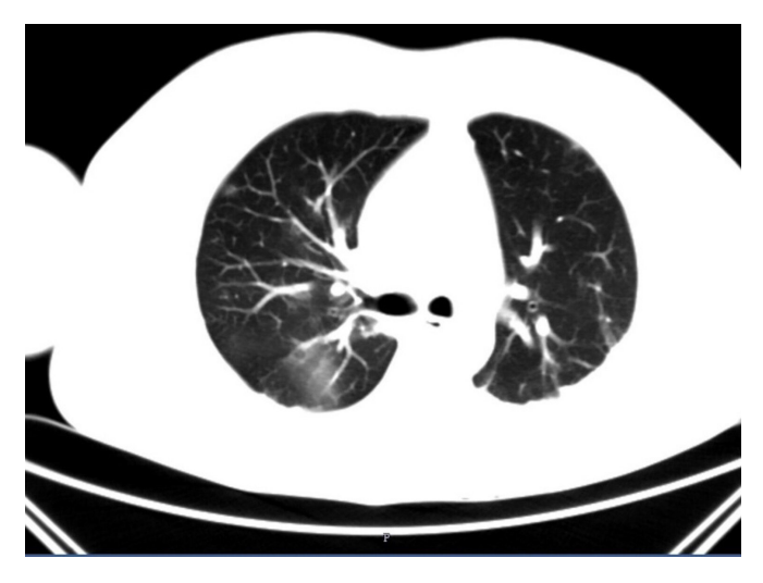
Figure 3 Multidetector CT pulmonary angiogram showing groundglass opacities.