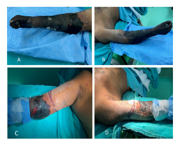
Figure 2 (A) Anterior and medial aspect of the upper limb showing gangrene extending above the elbow. (B) Posterior and lateral aspect of the upper limb showing gangrene extending above the elbow. (C,D) Level of incision marked.

arm over the deltoid region. The left upper limb was normal. All other peripheral pulsations were palpable. There was a reduced air entry with absent breath sounds in the left lower lung fields.