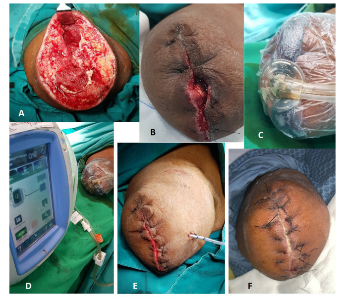
Figure 5 (A) Wound at reinspection after negative pressure wound therapy, (B) partially closed wound, (C,D) negative pressure wound therapy with colistin instillation on the partially closed wound, (E) wound closure with a suction drain in situ, (F) wound at suture removal.

The patient was reviewed 10 days after discharge (figure 5F). His sutures were removed and he was referred to physical medicine and rehabilitation department for muscle strengthening and stump prosthesis fitment. His oxygen saturation has improved to