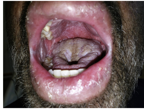
Fig 2. Overlap chronic graft-versus-host disease. Edema and crusted erosions of the vermilion lip with white patches on the palate and buccal mucosa.

dysphagia, rhinorrhea, and intermittent cough and negative for nausea, vomiting, diarrhea, and dysuria.