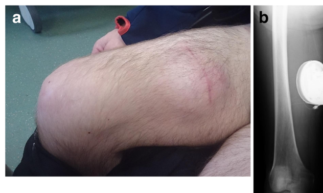
Fig. 1 a Subcutaneous location of intrathecal baclofen pump device in the right medial thigh 5 months after surgery. b Radiograph showing the subcutaneous placement of the intrathecal baclofen pump device with associated catheter located in the right medial thigh. The catheter is seen passing superiorly from the device towards the right neck of femur

At 1-month post-operative follow-up, evidence of dehiscence was still present along with underlying haematoma formation. Thinning of skin and small discharging vesicles were noted lateral to the scar. The patient underwent further surgery under the plastic surgery and neurosurgery team. The wound was debrided and washed out. A new proximal pocket was developed superficial to the deep fascia anterior to the thigh and the pump was re-sited for a second time. At post-operative follow-up, the patient was well and the wound was well healed. Six months later, there was no collection surrounding