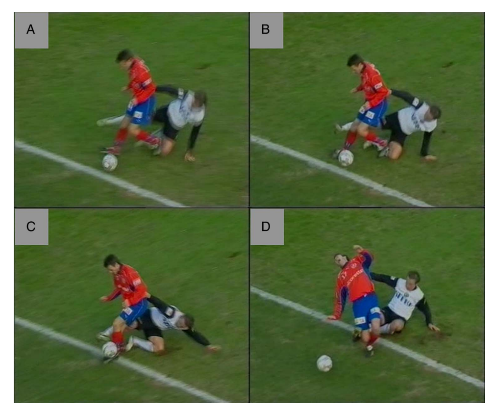
Figure 5 Direct contact mechanism (right knee). (A) At—60 ms, the player is jogging forward at slow speed towards the sideline trying to screen the ball from the opponent. (B) At initial contact, he strikes the pitch with his right heel and holds the trunk in a neutral position. (C) At 140 ms, having the entire load on his right leg, he is tackled from behind with forceful lateral impact to the knee joint. (D) At 440 ms, he falls backwards and his right knee clearly give way in substantial abduction (dynamic valgus collapse).

and suggests that knee valgus is also an important injury component in football. A sudden knee valgus increase was also reported in a non-contact ACL injury in a male professional football player, where the MBIM technique was employed.<sup>31</sup>