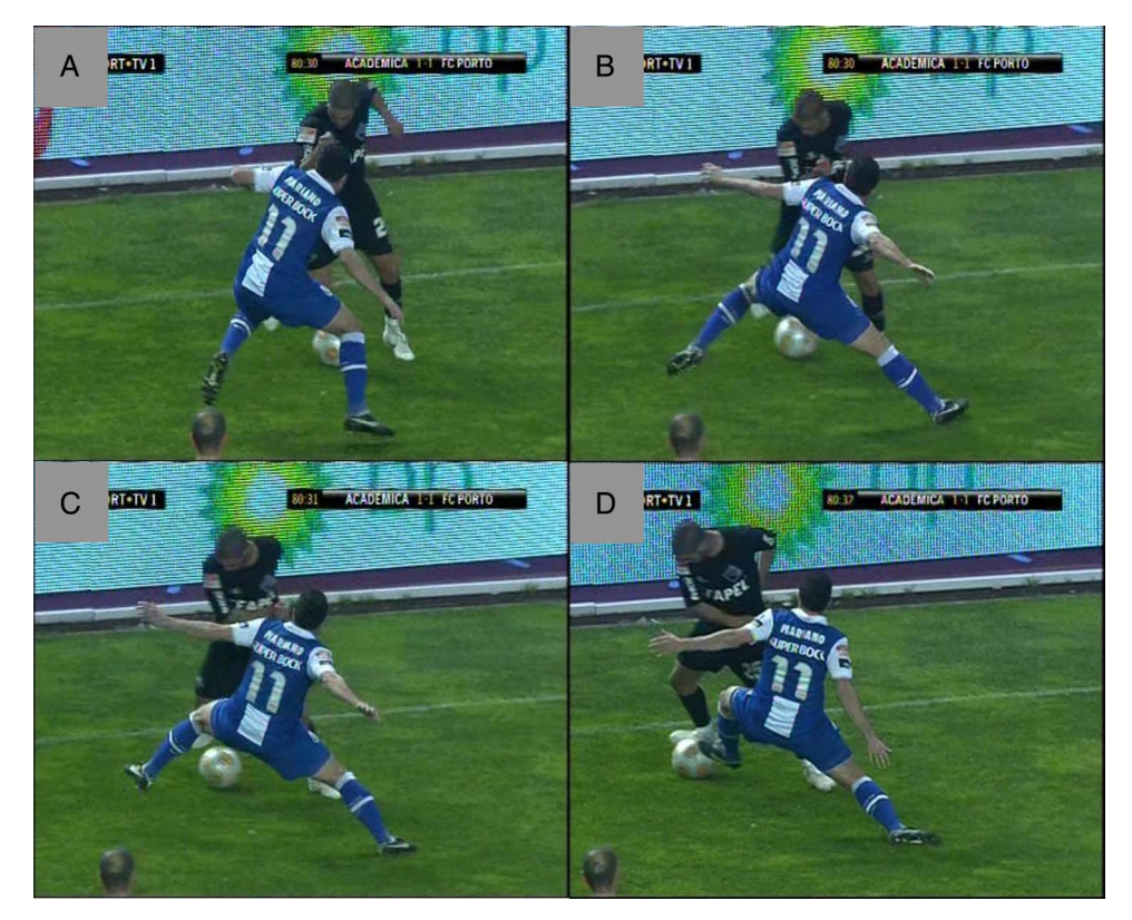
Figure 2 Non-contact pressing mechanism (right knee). (A) At—160 ms, the defending player is running forward at high speed towards the opponent in possession of the ball. (B) At initial contact, he strikes the pitch with his right heel and makes a sidestep cut in an effort to reach the ball or to tackle the opponent, but no player contact. (C) At 80 ms, he rotates the trunk towards his left leg and puts the entire load on his right leg. (D) At 240 ms the right hip and knee joints are in abducted positions and the ankle joint is in eversion (dynamic valgus without collapse).

All injuries occurring during landing after having headed the ball (n=5) were the result of non-contact injury mechanisms (table 2). The injured players landed mainly on one leg only (table 3). In all one-legged landing situations, the injured player landed on his forefoot (figure 4 and online supplementary video 3). The individual flexion angles at IC was 10° or less in all estimated cases for the knee, but showed greater variation for the hip (see online supplementary table S3). The median flexion angles were 10° for the hip and 5° for the knee at IC (table 4). Substantial hip abduction was seen in one case and knee valgus was seen in two cases (one unsure), and both of these were dynamic valgus collapses. Estimates of ankle eversion showed no clear trend: one 'yes', one 'no' and two 'unsure'.