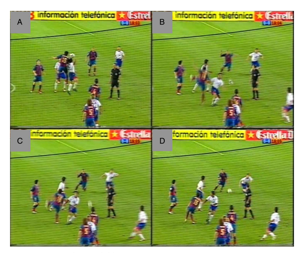
Figure 4 Non-contact heading mechanism (right knee). (A) At—306 ms, the player wins a heading duel while having trunk-to trunk contact in the air with his opponent. (B) At initial contact, he lands at high vertical speed on his right leg striking the pitch with the forefoot. (C) At 80 ms, being out of balance both backwards and sideways, he puts the entire load on his right leg. (D) At 186 ms, his right knee joint clearly give way in substantial abduction (dynamic valgus collapse).

Although the classification of knee valgus was uncertain as determined by visual inspection in 11 cases in our study, we observed valgus in 15 of the 19 remaining cases. This finding is in line with previous research from several other sports, <sup>10–13</sup> <sup>29</sup>