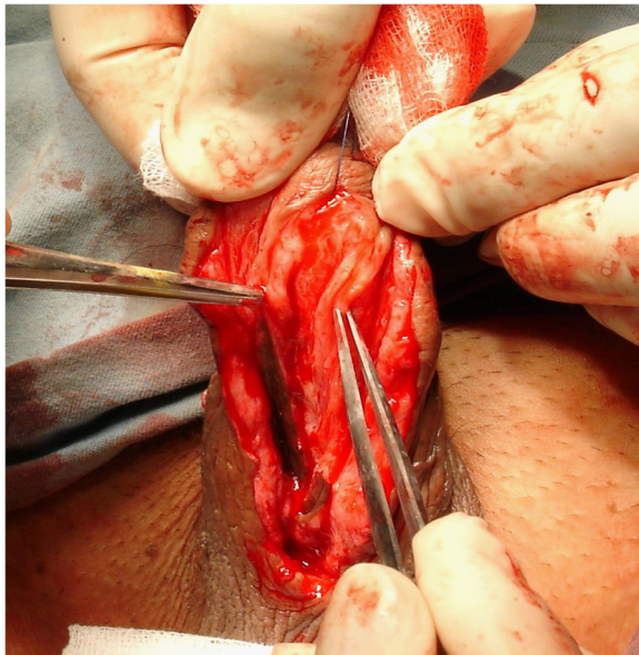
Figure 2 Panurethral stricture: urethra was laid open and split to the corpora cavernosa in the midline.

shape suturing to prevent wound contracture and fistula. The consent was obtained from the patient for his participation to publish Figures 1, 2, 3 and 4.