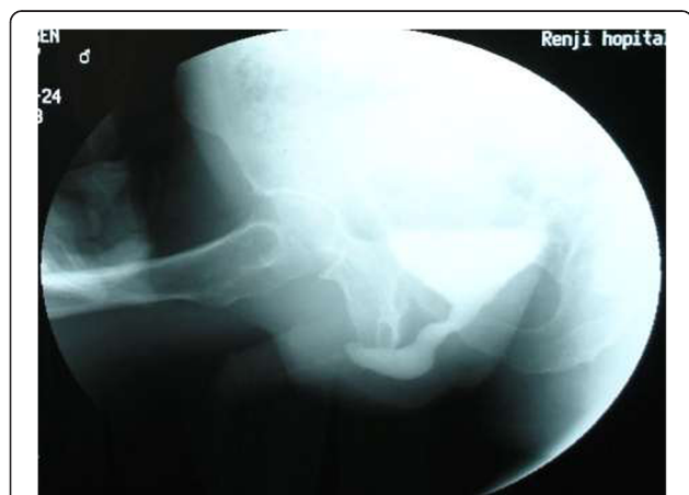
Figure 1 Routine preoperative imaging: a retrograde urethrogram showing a long AUS.

After surgery, all patients were followed up at least 12 months. Clinical evaluations including original diseases, sites and length of the strictures are summarized in Table 1. 61 patients (71.26%) had a previous surgical intervention (9 cases of urethral dilatation; 15 cases of direct visual internal urethrotomy (DVIU); 12 cases of meatotomy; and 25 cases of urethroplasty).