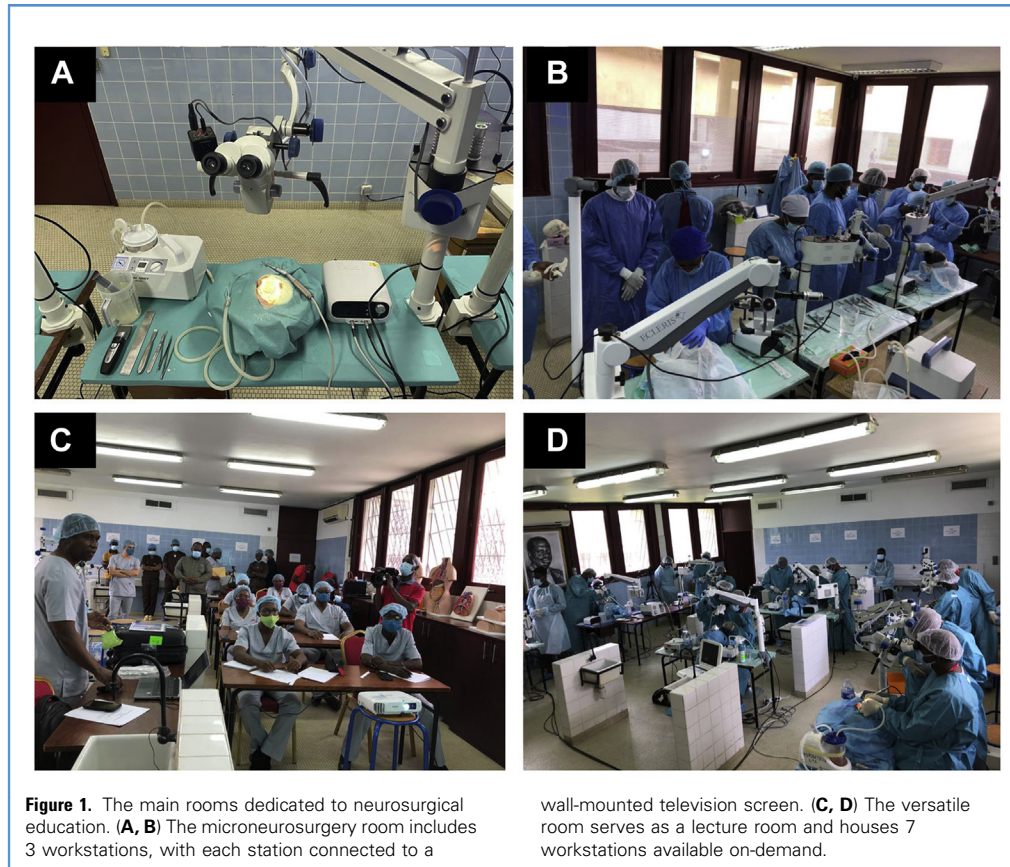
Figure 1. The main rooms dedicated to neurosurgical education. (A, B) The microneurosurgery room includes 3 workstations, with each station connected to a

wall-mounted television screen. (C, D) The versatile room serves as a lecture room and houses 7 workstations available on-demand.