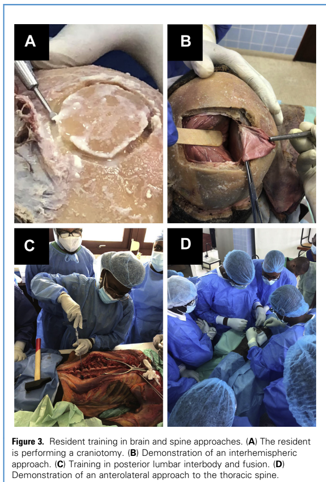
Figure 3. Resident training in brain and spine approaches. (A) The resident is performing a craniotomy. (B) Demonstration of an interhemispheric approach. (C) Training in posterior lumbar interbody and fusion. (D) Demonstration of an anterolateral approach to the thoracic spine.

patients overseas for care, and the return of foreign-trained neurosurgeons are among the factors helping efforts toward increasing the capacities and skills of African neurosurgeons. Moreover, initiatives such as Africaroo, the Foundation for International Education in Neurological Surgery, CURE Hydrocephalus and Spina Bifida, and the World Federation of Neurosurgical Societies Rabat Training Center have provided substantial support to increase the neurosurgical workforce in the continent. 8 Recently, Burkina Faso, Cameroon, and Niger started their neurosurgery residency program, increasing the number to 40 training programs in sub-Saharan Africa. 9 With these training centers, more local neurosurgeons will become available, reducing the access gap to neurosurgical care. However, this rapid expansion of training centers contrasts with the low number of dedicated cadaveric laboratories in the continent. After investigation, we identified neurosurgical laboratories in 4 countries: Egypt, Morocco, South Africa, and Cote d'Ivoire. Our country is part of the West African region, which has ~202 consultant neurosurgeons and >200 trainees spread throughout 16 local programs. 9,10 Therefore, having a neurosurgical cadaveric laboratory in this region is an undeniable asset for educational purposes.