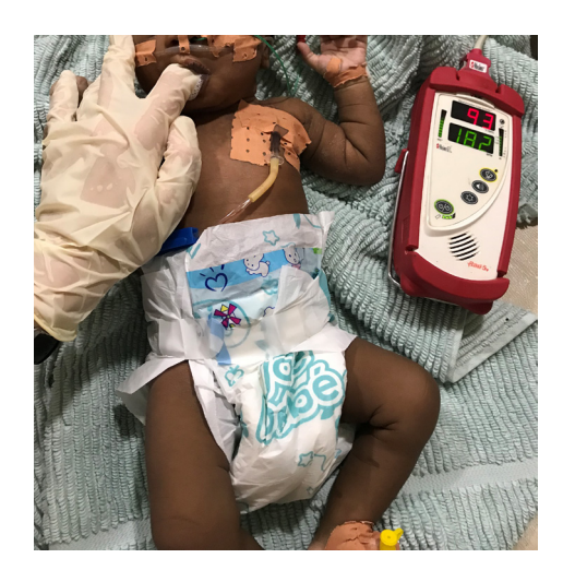
Figure 2 Fixation of the peripheral venous catheter after needle decompression of the chest. Common plasters were used to attach the catheter to the chest wall and to secure the connection between the tubing system and the catheter.