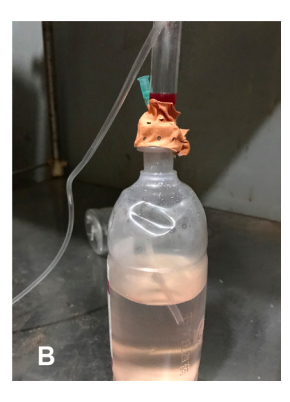
Figure 3 Improvised underwater seal drain. A: Schematic representation of the underwater seal drain. B: An intravenous tubing system was inserted into the intravenous bag and placed into the liquid to ensure a water seal. The system was closed using common plasters and a needle was inserted into the bottle serving as an air release valve. Before placing the drainage system on the floor, it was checked for oscillation in relation with the patient's respiratory movements.

performed, and the G16 venous catheter was left in place and secured with plasters (figure 2). A single bottle underwater seal chest drainage system was improvised using a half-empty intravenous bag, tubing, a needle and plasters (figure 3, online supplemental file 1). The system was checked for oscillation according to the respiratory movements of the patient. The bottle was put on the floor and the child in an anti-Trendelenburg position overnight. To minimise the pain caused by the rigid catheter in the chest cavity, paracetamol, as the only available analgesic, was given intravenously at a dose of 15 mg/kg every 6 hours. The next day, another chest X-ray was performed showing an almost complete expansion of the left lung with physiologic position of the mediastinum (figure 1). The chest drain was removed and the patient positioned continuously on his left side for another 2 days. During these days, the general condition of the child was satisfactory with no signs of respiratory distress and a Silverman Score of 0/10. The patient was discharged on day 6 with a normal chest X-ray (figure 1). His development has been normal since then with satisfactory weight gain (being exclusively breastfed during the first 6 months), and no other respiratory problems have been reported. The patient is now almost two years old. The aetiology of the pneumothorax remains unclear.