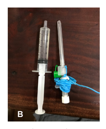
Figure 5 Improvised Heimlich valve using the fingerstall of a vicryl glove. A: Schematic representation of the Heimlich valve. B: The fingerstall was attached to the venous catheter using a common thread.