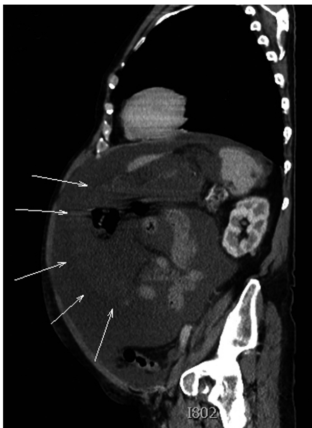
Figure 2. Sagittal view. The arrows highlight the omental cake.